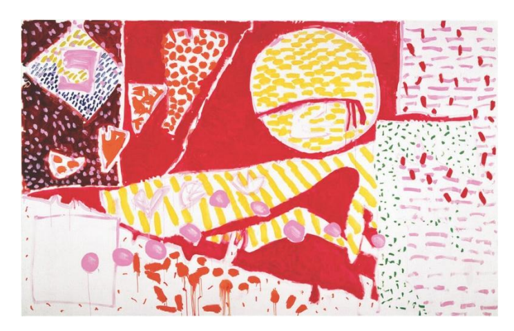
Red Garden Painting: June 3 - June 5: 1985