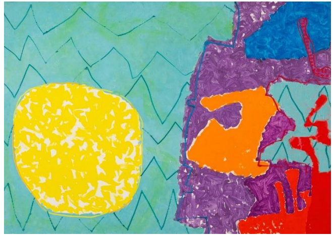
Lemon Disc in Sea Green with Zig-Zags July - December, 1982