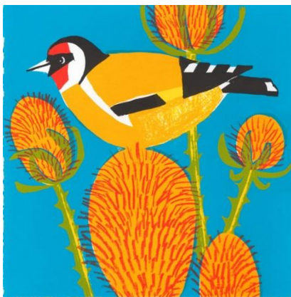
'Goldfinch' screen print (2022)