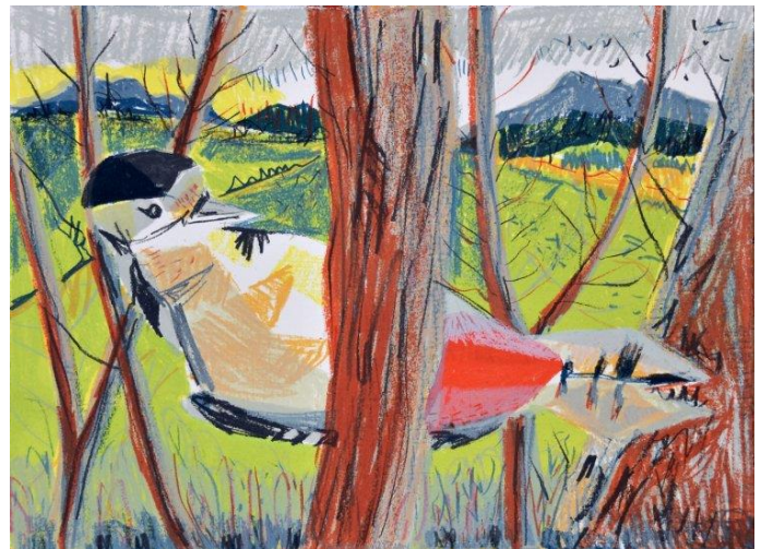
'Northumbrian Woodpecker' (2017)