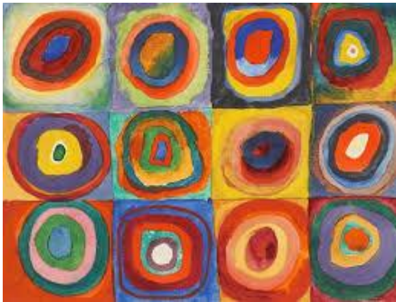
'Colour Study. Squares And Concentric Circles' (1913)

This month's artist is: Wassily Kandinsky