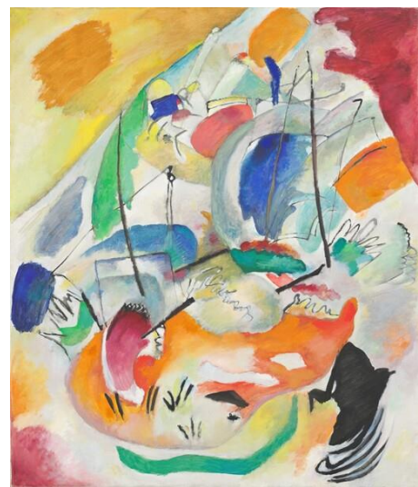
'Improvisation 13' (Sea Battle) (1913)

Wassily Kandinsky (1866-1944) was a Russian painter. Many people think he was the first abstract artist. Abstract art is a combination of colours, lines, and shapes that are not meant to be realistic.