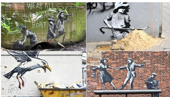
'A Great British Spraycation' (2014)