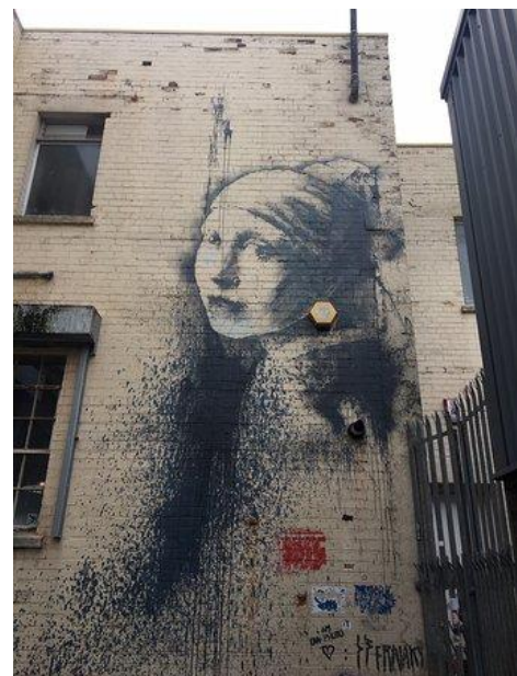
'Girl with a Pierced Eardrum' (2014)

Banksy is an anonymous graffiti artist. That means they keep their identity hidden. They will not do media interviews, they won't release their real name, and they will not allow photos or copies of their artwork to be made and sold. Because Banksy does not like people to know their identity they make their art in secret, even though it is often in busy places. Their work is often about war, politics and other issues that they think are important.