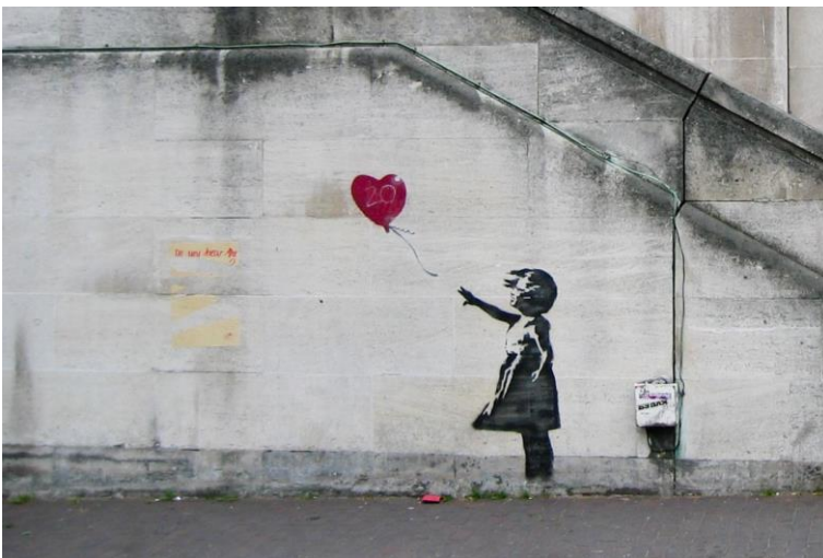
'Balloon Girl (2002)