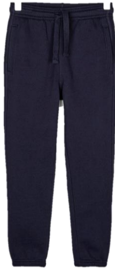
Plain Navy PE joggers