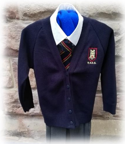
Girls School Uniform