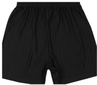
Plain Navy PE Shorts

Your child will have two PE lessons every week. You will need to provide plain navy shorts, plain navy tracksuit bottoms and sweatshirt or fleece, school navy PE polo shirt, black pumps for indoor PE lessons and trainers for outdoor PE lessons. All items will need to be sent into school in a clearly named draw-string PE kit bag. This will be kept on your child's peg. It will be sent home at the end of every half-term for washing. Please take the opportunity to check that the uniform, in particular pumps/trainers still fit before sending them back at the start of the new term.