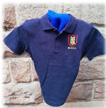
School PE Polo Shirt