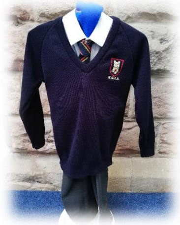
Boys School Uniform