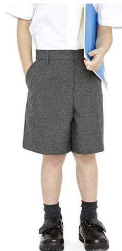
Boys Summer School Uniform – Grey shorts with shirt and tie