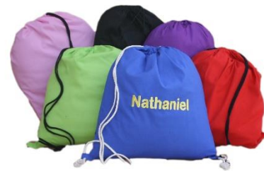
Draw-string bag (named)