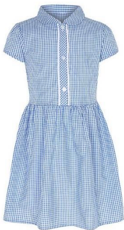
Girls Summer School Uniform – Navy/Blue gingham dress