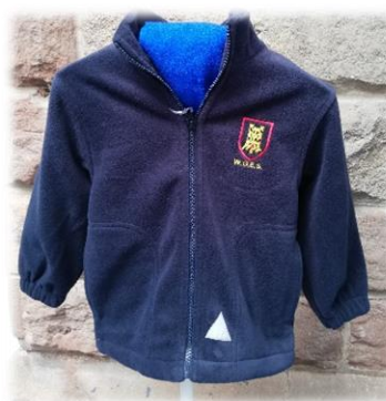
School PE Fleece