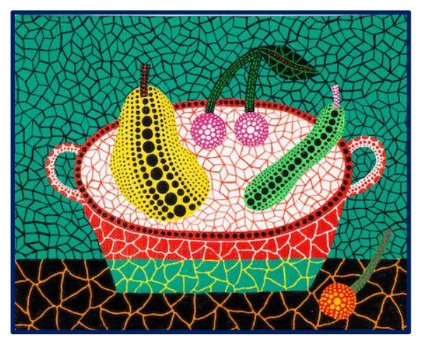
Yayoi Kusama - Fruit (1996)